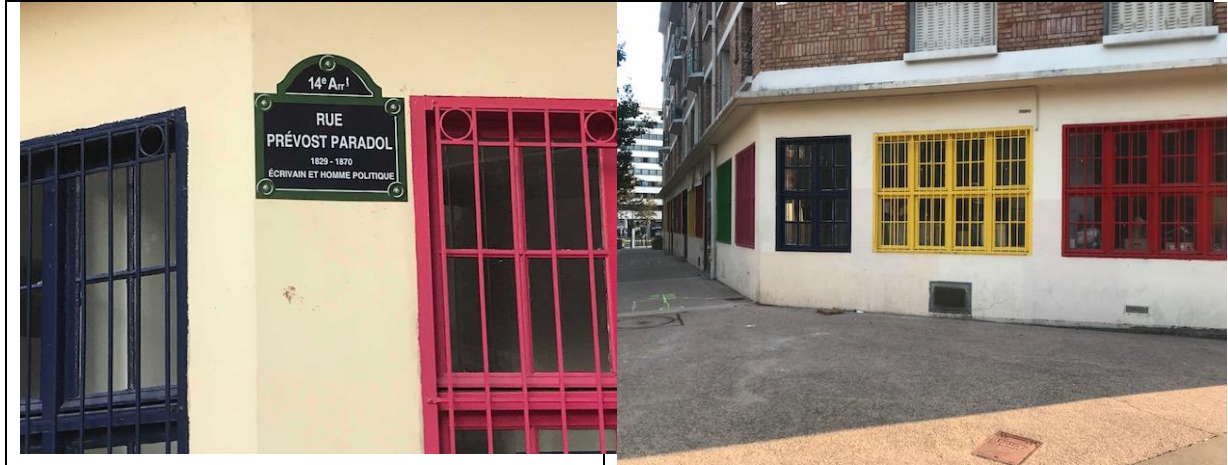
Pictures 2 and 3: view of rue Prevost Paradol, opposite the entrance gate